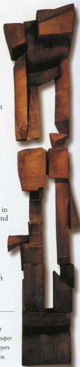
Isobel Egan Prize winner 1999 Ceramics Category Ceramic wall piece made from crank paper clay, white stoneware slip applied in layers coloured with oxides and stains. Approx. 135cm in length and 35cm wide Commission enquiries: 045 868487

allowing the work of Ireland's most promising and established craft designers to be viewed by a larger audience.