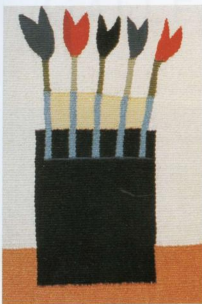
Gillian Freedman Prize winner 2000 Tapestry Category Tapestry wallhanging "Disciplined Tulips" Commission enquiries: 01 676 7782

Now the RDS Crafts competition is a major event in the Irish Crafts industry calendar. It allows professional and amateur craft designers to compete together for prestigious awards and gives them an opportunity to display their skill and workmanship, as seen in the illustrations. This is Ireland's most prestigious craft competition and for over 30 years it