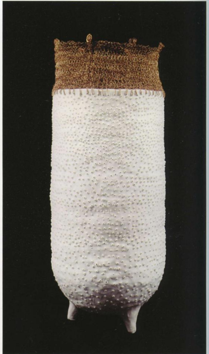
opposite, top left: JAMES EVANS Auberge , 2007, 30 × 36 × 36 cm (12 × 14 × 14 in.) Ceramic